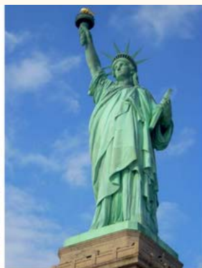
HERITAGE ACADEMY – 2024 FALL LIBERTY TOUR BOSTON, MA AND NEW YORK CITY, NY