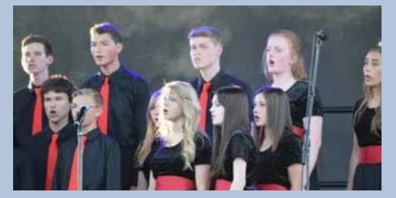
Click here for more information